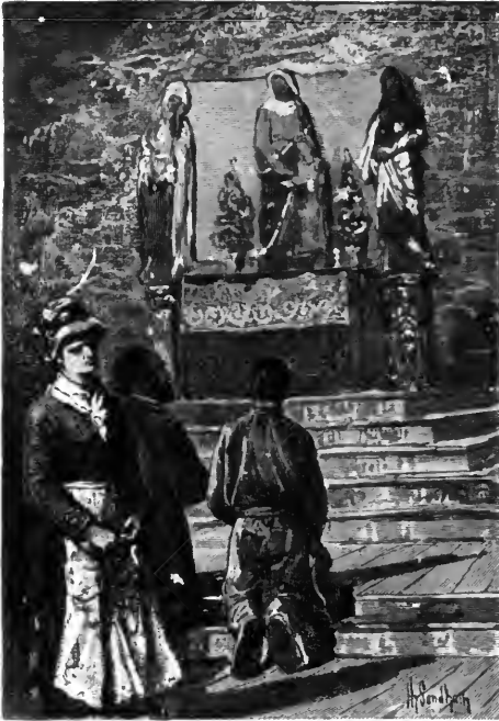
IN THE NEW CHURCH, ON THE SITE OF THE OLD.

do not know to what part of the body it belongs. The dry bones of the saint do not appear to differ in glory from those of a sinner. The church also claims to own a piece of the true cross upon which our Saviour died, and a piece of stone from the foundation of the house in which Ste. Anne lived, brought from France in 1879. Also there may be seen a superb chasuble, given by Anne of Austria, mother of Louis XIV., and some silver crucifixes.